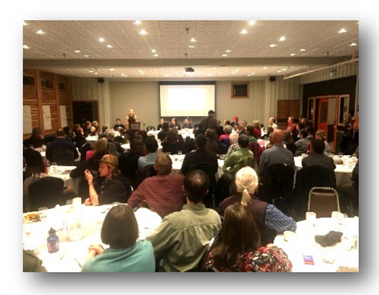
Homelessness Action Week