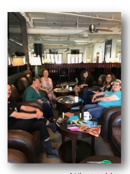
Art therapy workshop

Nelson CARES recognizes that selfcare is an important part of community work. In June, our staff enjoyed a day of relaxing activities at the Adventure Hotel including ear acupuncture, yoga, art therapy and more.