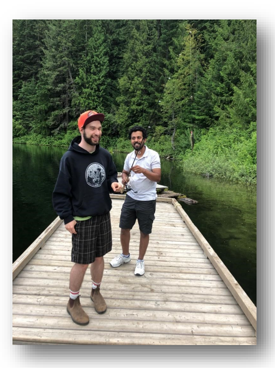
Out and about