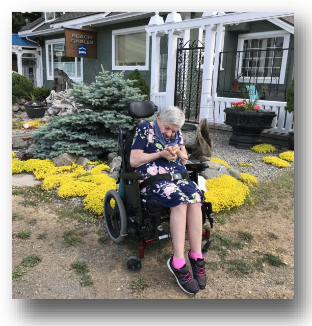
Resident on vacation