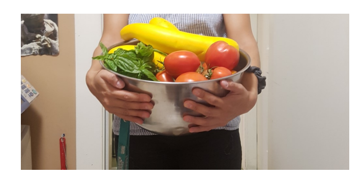
Garden Abundance! The gardens are cared for by staff and clients.