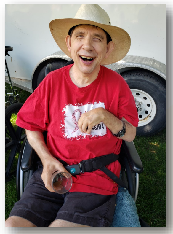
Enjoying Canada Day festivities!

43 employees provide daily supports to 14 residents