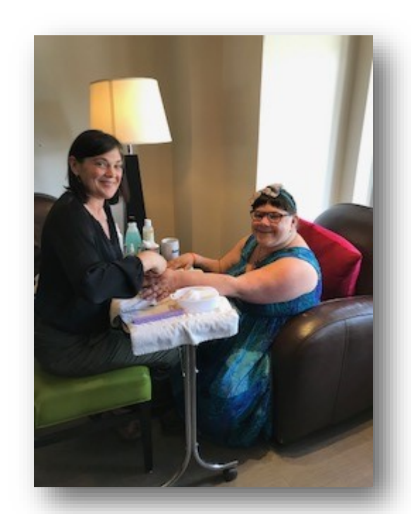
Winner of a free manicure!