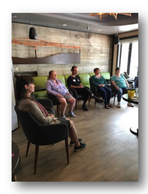
NADA ear acupuncture circle