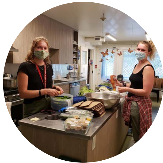
Pictured: Stepping Stone Staff preparing food for the clients.