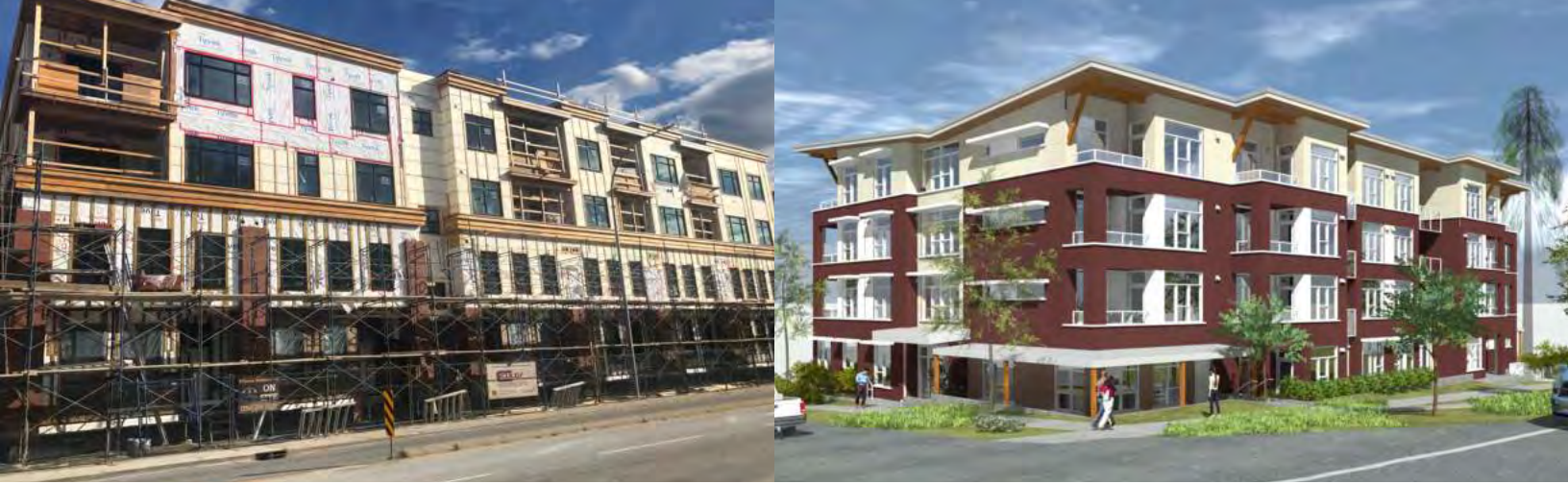
Pictured: 205 Hall Street Place (L) and Lakeside Place (R)

COVID-19 clearly revealed many inequities we already understood. It shone such a bright light on these gaps that many joined with us in our work. A team of savvy sewers made 250 hand made masks for us in April and May when there was no personal protective equipment to be found; Nelson Brewing Company donated the proceeds of a specialty beverage called “Essential”; and all of our staff held together. It is impossible to share the depth of gratitude for our teams that worked the front line in the early days when there were so many unknowns.