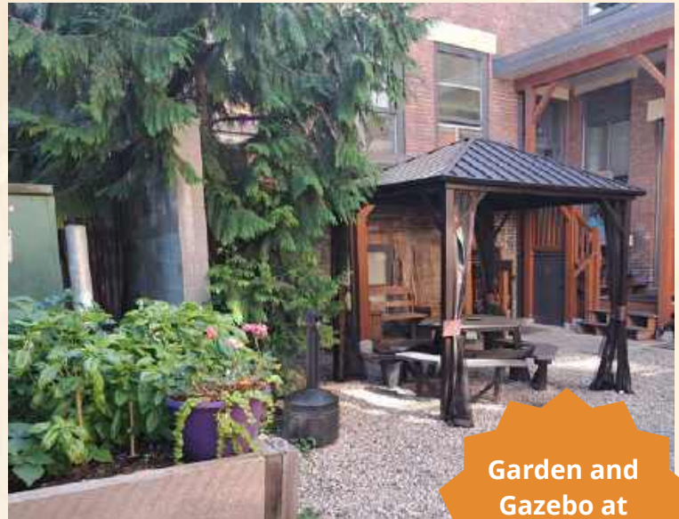
Garden and Gazebo at Ward Street Place

We focus on diversion from homelessness as well as a shelter program focused on housing for tenancy success and community building. Our program will reach full capacity with the relaunch of the North Shore Inn (NSI) in late fall. We hope to increase our housing portfolio with the addition of a new build with 50+ units.